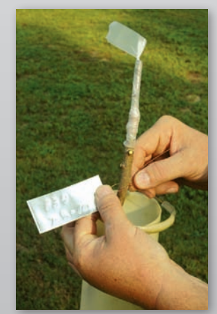
Scion wood from a female persimmon tree (the part wrapped in grafting tape) has been barkgrafted onto this male persimmon sapling, effectively cloning the fruit-producing female.