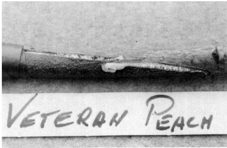
FIGURE 2. A peach graft after being placed in the hot-callusing pipe is well-callused.

PEAR - 'Bartlett' was grafted, hot-callused onto Calleryana rootstock with up to 92% success.