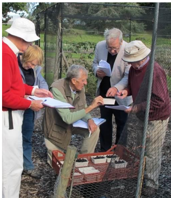
Assessment 30 September 2015