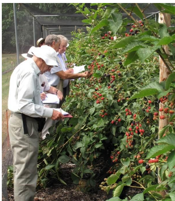
Assessment 7 August 2013