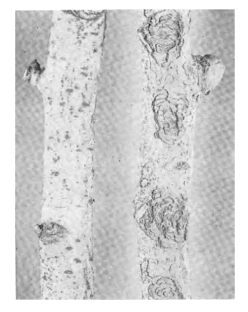
Bartlett pear branch showing (left) normal bark, and (right) symptoms of measles.

graft union. Old Home intermediate stocks which have become self-rooted are also highly desirable from the standpoint of blight control since both domestic pear seedling and quince roots are subject to blight infection through root suckers.